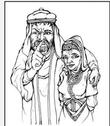
Twice Mordecai warns Esther to tell no one she is Jewish.

Have you ever been in a situation in which you decided that it would be wise not to say too much about your faith or your beliefs? What reasons did you have? As you look back now, what might you have done differently, if anything?