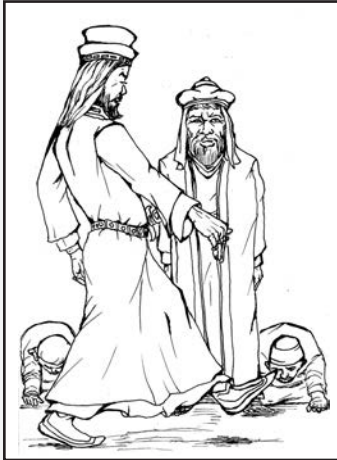
Mordecai refused to bow down to Haman, a mere man.

In Esther 3:1–5, Mordecai, a Jew—following the commandment against worshiping false gods and idols—refuses to bow down to Haman, a mere man. Furious, Haman tries to find a way to avenge himself. Mordecai, by his actions, is witnessing among these pagans about the true God.