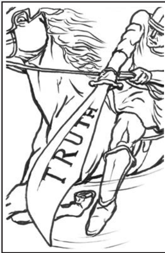
The red horse and rider show us the war that Jesus fights against Satan.

Look what happens when Jesus opens the 2nd lock or seal: the rider on the red horse ends peace on the earth. With no peace, people try to kill each other. What causes peace to end? War. The red horse and rider show us the war that Jesus fights against Satan. The rider does not kill anyone. But the big "sword" that Jesus uses to fight against Satan is the Good News. Satan fights back (read Matthew 10:34). He attacks Jesus by hurting God's people. That is why the 2nd horse is red, the same color as blood.