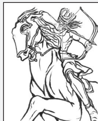
The first seal shows us a special time in history when God’s people first started to preach the Good News.

When we are on Jesus’ side in the war against evil, we are always on the winning side. Why is it important to remember that truth when times get hard?