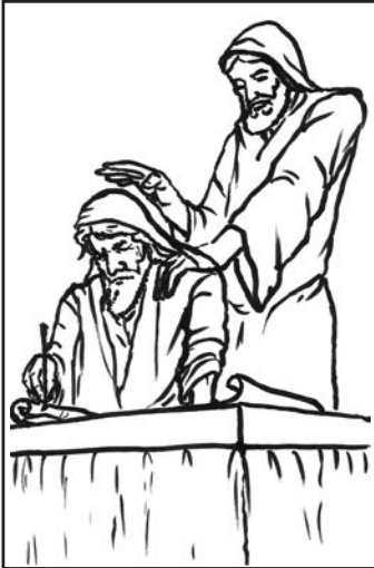
Our Holy God is the real writer of the Bible.

Read 2 Peter 1:19–21. What does Peter say about where the Bible’s messages come from?