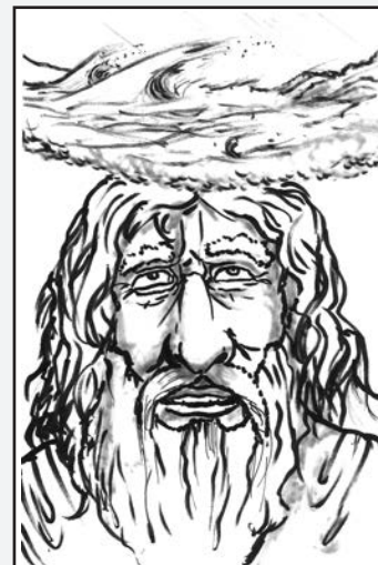
The Holy Spirit shows God's truth to the prophets.

"The Bible shows us that God is its writer. At the same time, the Bible was written by human hands. The Bible writers used different writing styles. We see these different styles when we read the Bible. Yes, the truths shown in the Bible are 'given by God' (2 Timothy 3:16, ERV). But they are written in the words of men."—Ellen G. White, The Great Controversy , page 7, adapted.