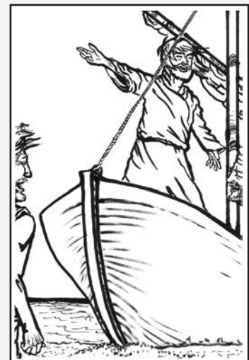
The Old Testament is the foundation for everything that Jesus and His followers taught.

New Testament writers believed that the Old Testament was God's Word. There are hundreds of Old Testament verses in the New Testament: 400 from Isaiah, 370 from the Psalms, 220 from Exodus, and so on. The New Testament is filled with special messages from the Old Testament too. Some examples are Matthew 2:5; Mark 1:2; Mark 7:6; and Luke 3:4. All of this shows that the Old Testament is the foundation for everything that Jesus and His followers taught.