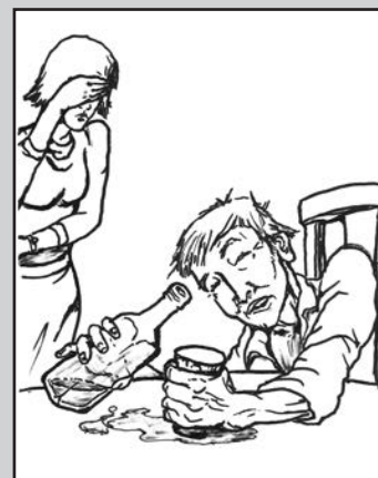
Ming-Huang went back to drinking.