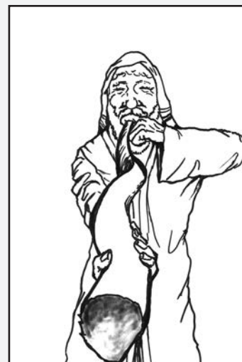
On the Day of Atonement, the holy leaders blew a special trumpet named a “shofar.”

On the Day of Atonement, the chief religious leader went into the Most Holy Room of the temple to make it clean from sin. God already forgave His people for these sins. That is why the people did not eat any food. Their fasting showed God their thankfulness for His gift of forgiveness. But the people in the time of Isaiah are filled with pride. They fast to show they are very holy. They do not see that their sins made the temple dirty.