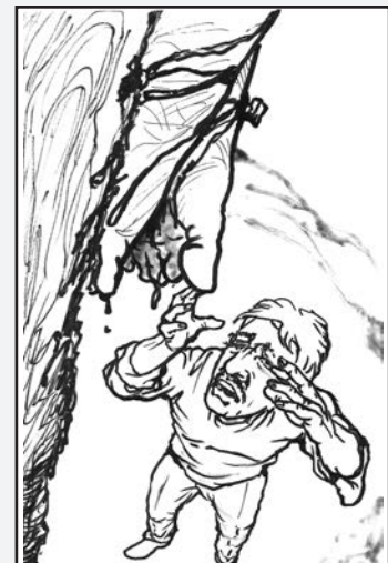
God offers forgiveness for free.

Isaiah teaches us about the Good News. The teaching about the Good News in the Old Testament is the same as the Good News in the New Testament. The Old Testament did not teach that we are saved by our good behavior. There is only one way that we can be saved. God saves us by our faith in His mercy (Ephesians 2:8). He gives us “the free gift of life forever in Christ Jesus our Lord” (Romans 6:23, ICB).