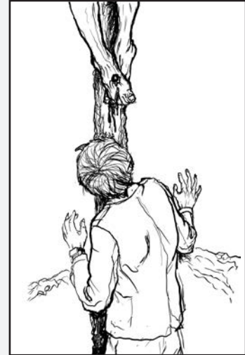
The Cross shows us God’s love for sinners.

The teachings of wise men have much to offer us. But why must we never let their wisdom come between us and Jesus, who uses the “foolish things we preach to save those [people] who believe” (1 Corinthians 1:21, NIV)?