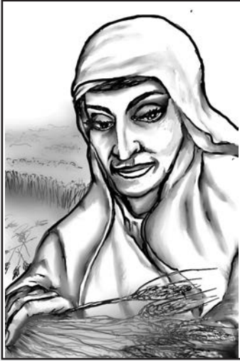
Examples of good workers are Ruth, Joseph, and Jacob.

God asks us to be honest workers. He wants other people to respect us and our work. Respect starts with God's law. We must ask God to write His law in our hearts (read Jeremiah 31:33). Then we will have success in our work. The Bible says, "It is better to be respected than to be rich. A good name is worth more than silver or gold" (Proverbs 22:1, ERV).