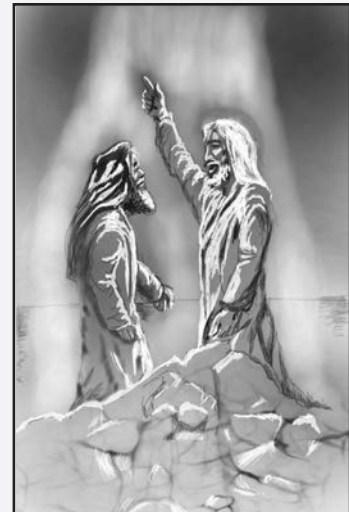
A Visitor from heaven came to John on that lonely island.

Should we expect to suffer for our faith? Explain.