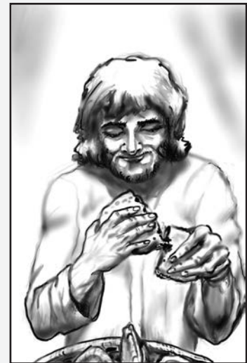
Jesus explains that this bread is a word picture for His body.

What does this story in John 6:51–71 teach us about how big groups of people are often wrong about things? Why must we remember this important idea when we share with other people those parts of our faith that many people, and even some Christians, do not like?