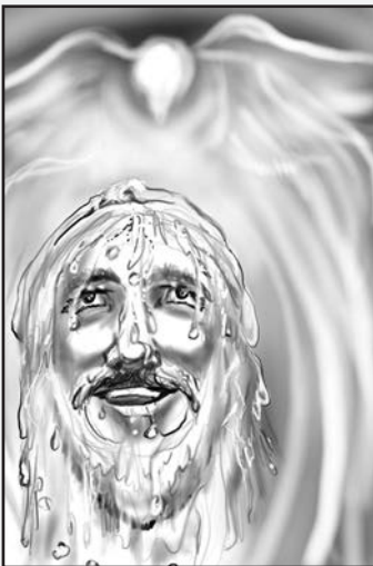
The Spirit rests on Jesus at His baptism (John 1:32–34).

What does God the Father say about Jesus? Read Matthew 3:17; Matthew 17:5; Mark 1:11; and Luke 3:22 (also read 2 Peter 1:17, 18).