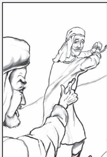
The forgiven servant had his fellow servant thrown into prison.

Read the picture story in 1 John 4:7–20. Look carefully at verses 7 and 19. What does the picture story tell us about God's love?