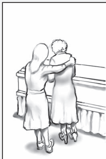
“‘Help the woman whose husband has died’” (Isaiah 1:17, NLV).

Jesus cared about being fair. He said, “You who pretend to be someone you are not! You give one-tenth part of your spices, and have not done the most important things of the Law, such as [like or as in the following examples] thinking what is right and wrong, and having pity and faith. These you should have done and still [continue to] have done the other things also” (Matthew 23:23, NLV).