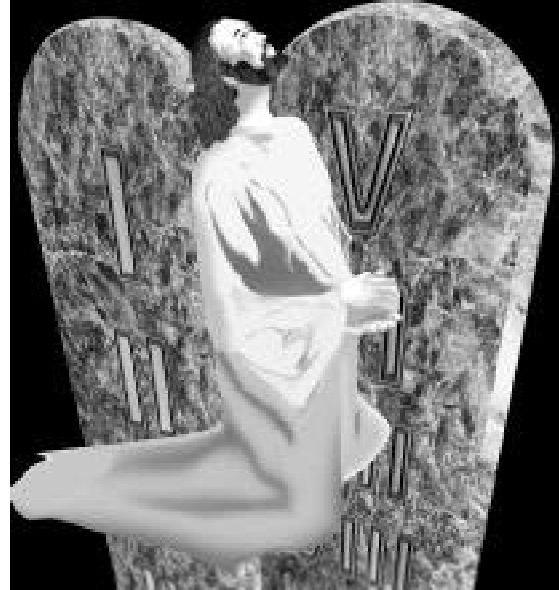
God's people will have the faith of Jesus and will keep the Ten Commandments.

tion 14. This truth is especially for the end of time. The end of time is very near.