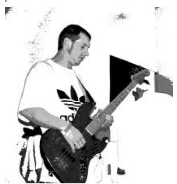
Who will tell this person about Jesus, and how?