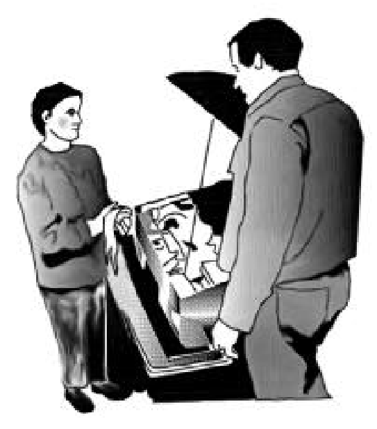
We need to spend more time working with people who need help so they will accept Jesus.

perienced people need advice. We are to weep with people who weep, and rejoice with people who rejoice. When we add the power of study, the power of prayer, and the power of God's love to the work we do for people, people will