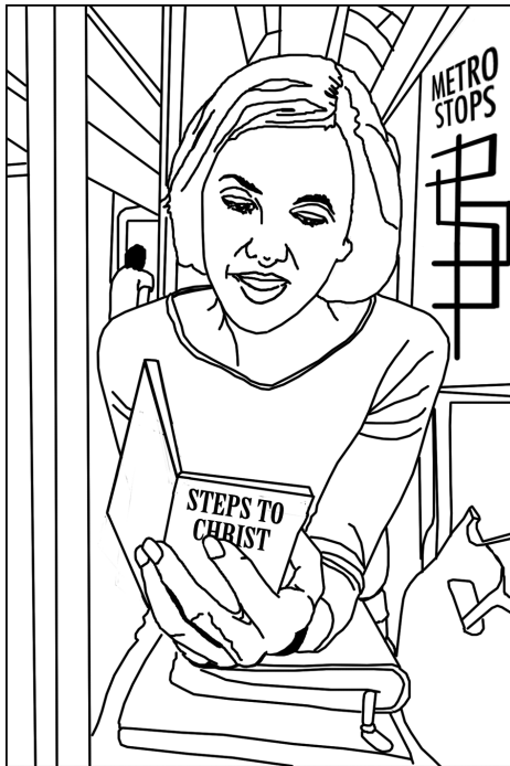
Focus on Jesus.

you read about Jesus, the more you will focus on holy things. The more you read about unholy things, the more you will think about unholy things.