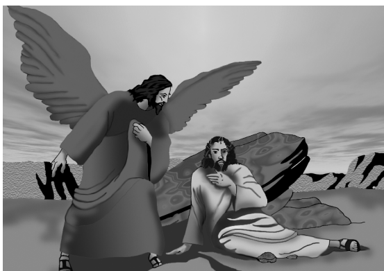
The Holy Spirit led Jesus into the wilderness to be tempted by Satan.

In the wilderness temptation, Christ had the same temptations Adam had. But Christ was in a much worse situation than Adam. Adam had a full stomach in a land of plenty while a very hungry Jesus was in a barren 3 wilderness. The three writers (Matthew, Mark, and John) who wrote about Jesus' temptation all said it was the Holy Spirit who had led Jesus into the wilderness. They also said it was Satan who had tempted Jesus.