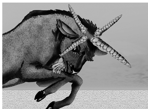
The little horn

Study some of the traits of the little horn. In what ways can each one of us show the same traits as the little horn?