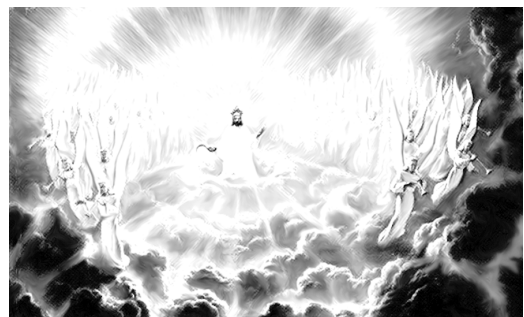
What problems will the Second Coming solve for you?

What things in your life can be solved only by Jesus’ second coming? What things can be solved here and now? Why is it so important to know the difference between what the Second Coming can solve and what it cannot solve?