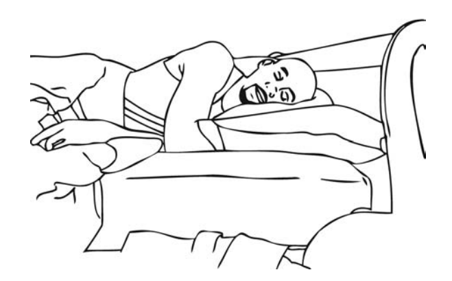
Jesus promises to give us rest for our souls.

What more attractive message could there be for people today who are stressed, burned out, and looking for comfort and peace?