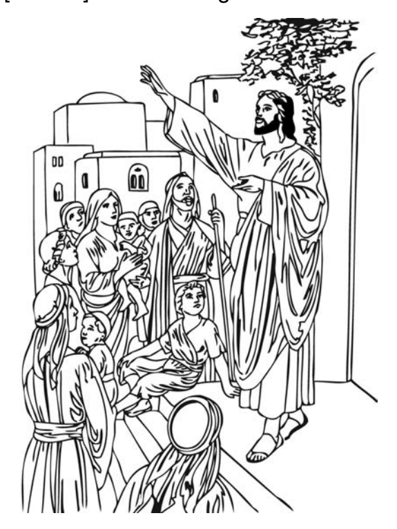
Great crowds came to learn from Jesus.

There were no subways, trains, or buses in Jesus' time. No one jumped on a plane, in a car, or even on a bicycle to visit Jesus. Travel back then was slow and very dangerous. But that did not stop "great multitudes [crowds]" from coming to Jesus.