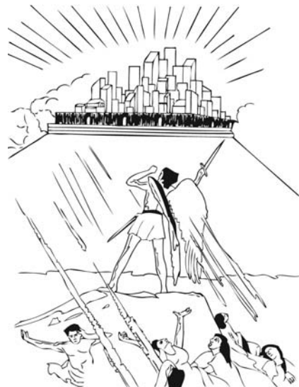
At the end of the 1,000 years, the wicked are brought back to life and join Satan's fight against God and His angels.

God's justice and love publicly will be accepted by all the people involved. Even Satan, his angels, and the lost publicly will admit that they were fighting for the wrong cause. They all will confess the righteousness (holiness) of God, admit the Lordship of Christ, and accept God's sentence pronounced against them by the righteous (holy) One (Philippians 2:9–11). In other words, the wicked will admit that they deserve to die. This is the sentence of "guilty" reached by the people of God. The whole universe is finally in perfect agreement: The forces of evil must be removed. At that time the universe will be cleansed from any doubts about the justice and love of God. Every intelligent person will be united (joined together as one) in praising God's love and justice.