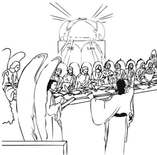
The saved will work with Jesus as judges in the heavenly court.

Third, the study in heaven takes place in the setting of the judgment of the wicked (1 Corinthians 6:2, 3; Revelation 20:4). The saved will join the heavenly court and will take part in studying and examining the lives of those who were stubborn in their rebellion against God. The saved will rule with Christ for 1,000 years, in such a way that they will work with Him as Judge. They can witness in the throne room of the universe the fact that God did all He could do to save repentant sinners. And they will know that the lost should now accept responsibility for their decisions (choices). In short, we will all believe that God's final actions toward the lost will be right.