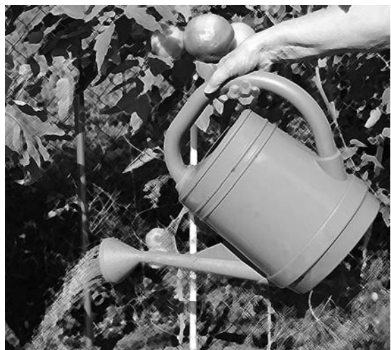
God is the One who makes every seed of faith grow.

The goal of the Christian is to grow strong in faith. This is a lifelong practice. We experience the blessing of growth and “stand firm in the faith” (1 Corinthians 16:13, NIV). At the same time, we may wonder why others are still “weak” (Romans 14:1, NIV). But we often forget that it also has taken most of us some time before we became as strong as we are today in Christ. But no matter how we feel, we should never feel proud or judge others (1 Corinthians 10:12). God is the One who makes every seed of faith grow. He also should be given credit for any growth that takes place in our spiritual lives.