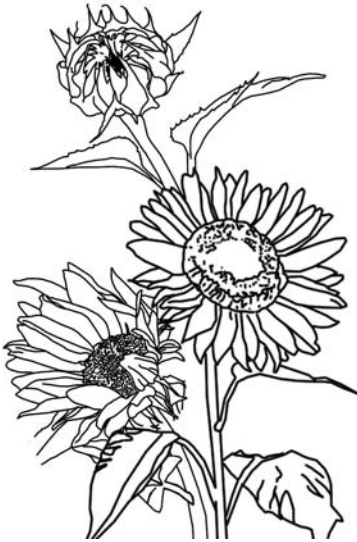
Faith in Jesus will grow as we come to know Him.

to gain more knowledge about the life of Christ and who He is. You will do everything you can to grow in grace and faith.