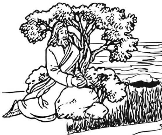
Jesus worked hard, but He always rested on the Sabbath.

Do you do too much or not enough? How can you live a more balanced life so that you can have better stewardship of your time?