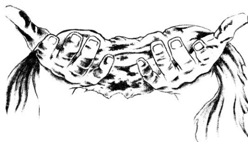
“Is this Joseph’s?”

So, the coat had a role both in the beginning and in the end. At first it was a symbol of the relationship between Jacob and Joseph. Then it was covered in blood, a symbol of Joseph’s “death.” The brothers might have thought that it would be the end