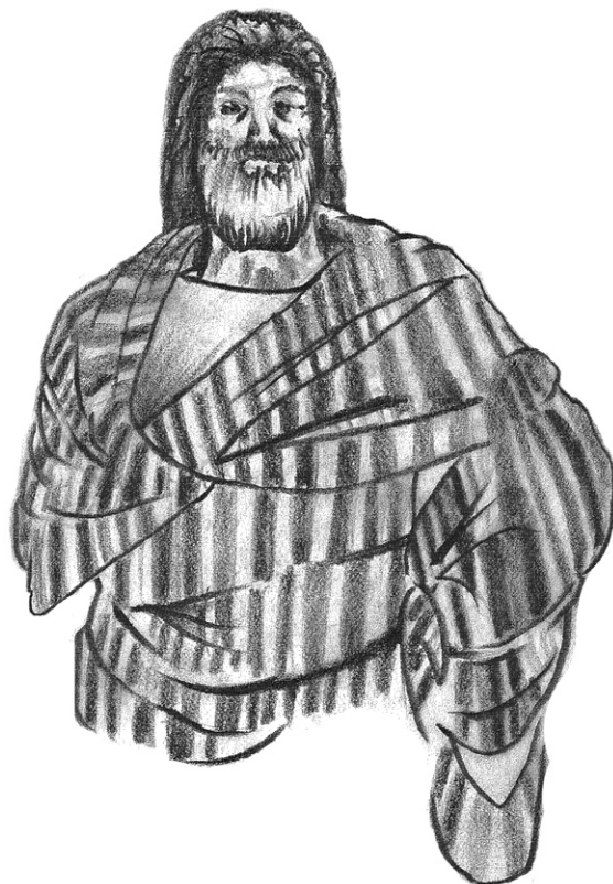
Joseph’s coat was beautifully woven in different colors.

It was more expensive than any of his brothers’ cloaks. It was the kind of cloak worn by great people. The brothers no doubt guessed that their father would give further honors to Joseph. That could mean that Joseph would get the birthright. 8 The brothers easily could have guessed that Joseph would get the greater inheritance. 9 Jacob’s act of giving Joseph the coat could have been just an act of love and nothing more. But it was a big mistake, because it made the brothers hate Joseph even more.