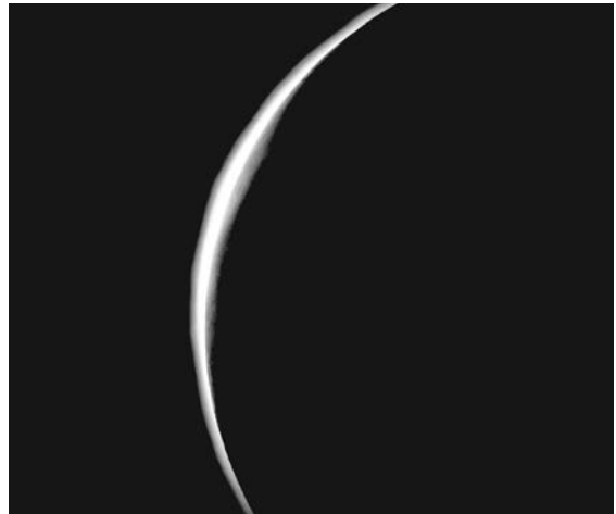
The earth was unformed, unfilled, dark and wet, and unfit for life.

The simple fact is, we do not know. But it is really not that important. The important point is that the Lord was not dependent upon things that had been there. Through the power of His Word (Jesus), God created a world that is fit for us to live in.