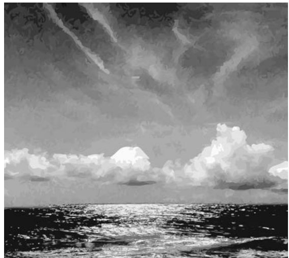
God created the atmosphere that we breathe on the second day of Creation.

The Creation story is mysterious. But one point comes through very clearly. Nothing is left to chance (accident). Why is that point important for us to know?