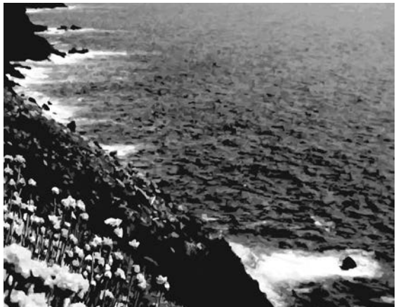
On the third day God causes dry land to appear and plant life to grow.

Look at the many different fruits and vegetables. How do they present powerful proof of God’s love for us? Why is it foolish to think that all these things came about through evolution? 2