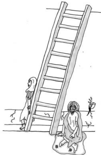
Lepers and prostitutes were at the bottom of the social ladder in Jesus’ day.

What is your own attitude (feeling) toward outcasts? Be honest: do you feel that you are better than they are? If so, think about what those feelings mean.