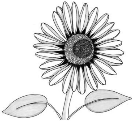
Nature still tells of the goodness of God.

looked down on those who had not been as blessed as they themselves had. They hated the publicans and sinners. But God saw that their guilt was the greater. Heaven's light was flashing across their pathway, saying, 'This is the way, walk ye in it;' but they had spurned [refused to accept] the gift."—Adapted from Ellen G. White, The SDA Bible Commentary , volume 5, page 1088.