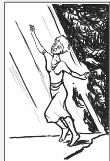
Christians are called out of darkness into the light.

As 1 Peter 2:10 states, Christians now form their own people. They once were not a people. But now they have received mercy to become a holy people (read Hosea 1, 2). In the Bible, the word holy usually means set aside to worship God. So, as a “holy” nation, Christians are to be separated from the world to worship God. This separation will be shown in the kinds of lives that they live. They are also to be like a fire on a cold night. Such a fire will draw others to its warmth. In this way, God gives Christians the work of sharing with others the salvation that they have experienced for themselves.