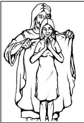
In Galatians, Paul says baptism means being "clothed with Christ."

In Galatians 3:26, the word translated as "sons" (NKJV) comes from the Greek word hyios . Other versions of the Bible translate this word as "children." But in Greek, hyios means "a son." There are at least two reasons Paul uses the Greek word son here instead of the Greek word for children . First, Paul was thinking about the family wealth that would be passed onto the firstborn son. Also, Paul had in mind the wording "sons of God." This name was used for Israel in the Old Testament (Hosea 11:1). But now non-Jews also could enjoy the special relationship with God that only Israel had enjoyed. And not just males. Paul clearly includes females in this relationship as well (Galatians 3:28).