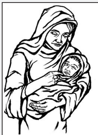
“God sent His Son.”

Read John 1:14; Galatians 4:4, 5; Romans 8:3, 4; 2 Corinthians 5:21; Philippians 2:5–8; Hebrews 2:14–18; and Hebrews 4:14, 15. According to these verses, why did Jesus need to become human to save us?