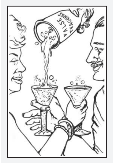
When people accept Babylon's "wine," they act the same as drunk people.

In the end time, almost everyone on earth will be tricked by Babylon. What does that show us about the dangers of going along with what most people say is right?