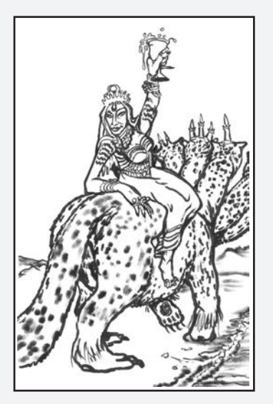
In his vision, John sees an evil woman who sits on a red wild animal.

Babylon's clothes also help us remember the clothes worn by Israel's top holy leader in the Old Testament. This leader is the high priest. His clothes also have the same colors that the prostitute wears: purple, red, and gold (Exodus 28:5, 6). The colors of these clothes tell us that the woman is a word picture for the end-time religious power that Satan uses to turn the people on the earth away from God. She is "drunk" from drinking the blood of God's people who died for their faith. That connects end-time Babylon to the Roman Catholic Church in the Middle Ages. That church killed millions of Christians because they believed the Good News about Jesus.