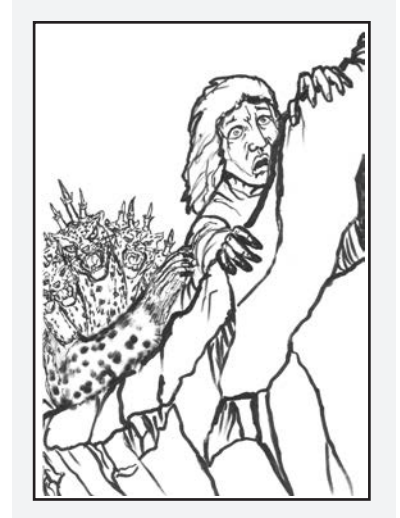
The wild sea-animal power made war with the woman in the white dress and beat her (Revelation 13:5–7).