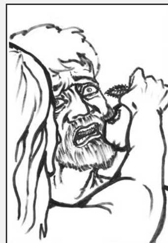
Adam and Eve were free to choose (Genesis 3). Sadly, they made the wrong choice.