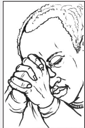
Before we make decisions, we must pray.

5. Proverbs 15:22; Proverbs 24:6 _____ _____