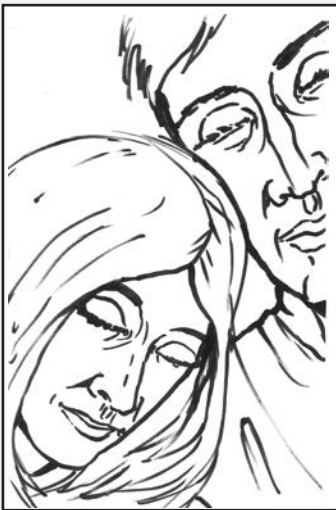
Love is a choice.

Ephesians 1:1–4; Titus 1:1, 2; and 2 Timothy 1:8, 9 tell us that God chose to save us. What do we learn about that choice from these verses? When did God choose to save us?