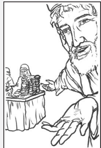
Nehemiah gives plenty of food to people during the time he is governor.

Read Philippians 2:3–8. What rules are shown in these verses? How can you show them in your life right now?