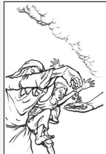
Some families sell their children as slaves to get money.

In Nehemiah's time and in ours, governments are not always fair to people. They make laws that cause people to borrow money they cannot pay back. The Bible talks about this problem. What message does that tell us about God?