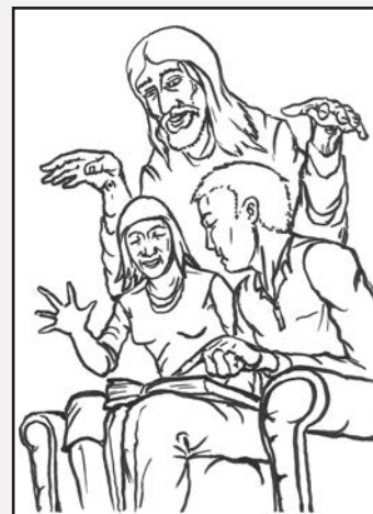
When we read the Bible, God comes near to us.

Nehemiah 9:3 says that the people read from the Book of the Law, or Torah, for about four hours. Then for four more hours, they confess sin and worship God. Do you see how important reading the Bible is? When we read the Bible, God comes near to us. The Holy Spirit speaks to us and teaches us. Bible truth changes our thoughts. Truth makes us wise. The Bible encourages us and lifts us up. The Jews also cry. Why? Because when we spend time with God, we see how good and beautiful He is. We feel awe that the One who made us wants to be with us, even if we make mistakes.