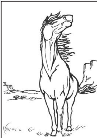
God is the One who keeps everything alive.

Why is it important to remember that God made us?