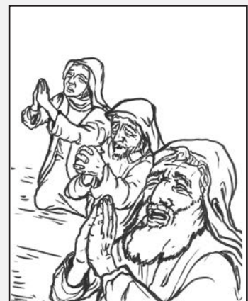
The Jews ask God to show them mercy. Even if they are not worthy of it.

Read Romans 5:6–8. How do these verses show us what the Jews in Nehemiah’s time wanted God to give them? What comfort and hope do these verses give us?