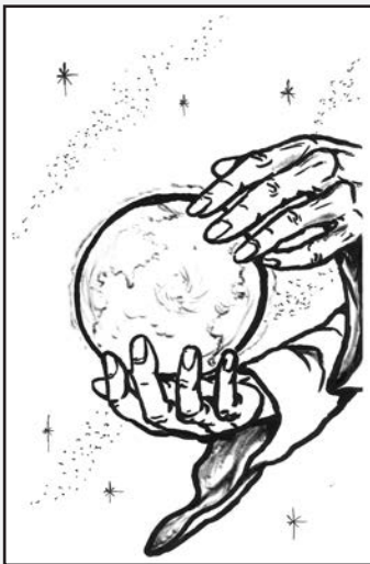
God controls history. He controls everything that happens.

What can we learn from the names, dates, places, and happenings in these verses? First, we learn that the special message about the future happens exactly as the angel says. God's messages to us never fail. Second, God controls history. He controls everything that happens. So, we can trust that He will destroy evil forever and set up His everlasting kingdom.