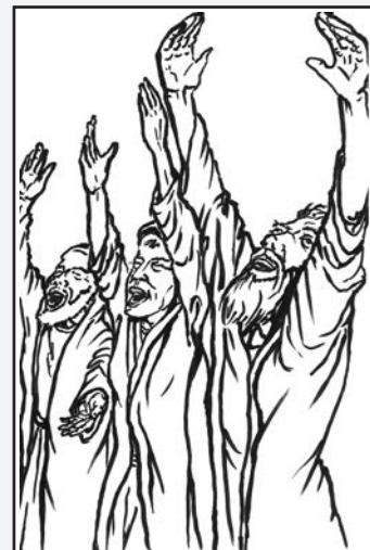
Pliny wrote about Christians who sang hymns to their God, Jesus.

History writers who lived during the first 200 years after Jesus also talk about Jesus of Nazareth. Tacitus is one of them. He is a Roman writer of history. Tacitus writes about several Bible topics: (1) Jesus, (2) His death by Pontius Pilate during the time of Tiberius, and (3) early Christians in Rome. Pliny the Younger was a Roman governor. In A.D. 112–113, Pliny writes to the Roman King Trajan and asks him what he should do about the Christians. Pliny says that the Christians meet on a certain day before the sun comes up. Then the Christians sing hymns as to a god. These writings give us more proof that Jesus was a real person.