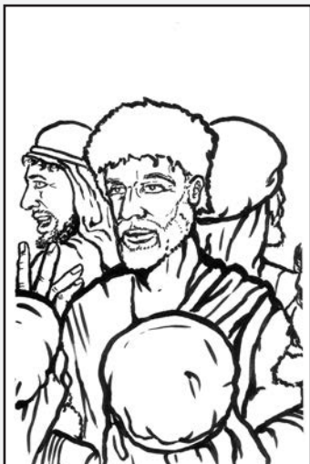
Paul and his friends help each other in their work for God.

The New Testament church grew big fast. In a few short years, it grew from a small group of believers to tens of thousands of worshipers. There are many reasons for this fast growth. (1) Jesus' work on earth helped get people ready to accept the preaching of His followers. (2) After Jesus went back to heaven, God poured His Spirit on Jesus' followers. (3) The New Testament church grew so fast because it was divided into small groups.