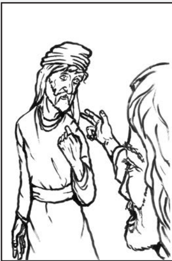
Jesus invites Matthew to follow Him.

John in his Gospel tells us that he and Peter already knew Jesus for more than a year. But John and Peter have not given their lives fully to Jesus. There must be something in Jesus' words, face, or actions that shows Peter and John that Jesus invites them to serve God. Peter and John leave their boats, jobs, and everything they know to follow Jesus. Why? Jesus invites them to do something more with their lives. Peter and John are ordinary fishermen. But they understand that Jesus asks them to do something very special. Maybe God is not asking you to leave your job today. But He wants you to do something special for Him. He wants you to share His love. He also wants you to tell people about His truth and bring glory to His name.