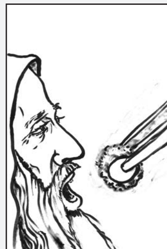
The seraph, or angel with six wings, puts the coal on Isaiah's lips.

Fire makes things clean. It burns away sin (Numbers 31:23). But the seraph uses a coal from the special, holy fire on the altar. God Himself started the fire. The holy leaders do not let it stop burning (Leviticus 6:12). The reason that someone takes a coal from the altar is so he can burn the sweet-smelling spices. If you look at Leviticus 16:12, 13, you will see that the high priest uses some coals from the altar to light the spices. But in Isaiah 6, the seraph puts the coal on Isaiah's lips and not on the spices. Remember, King Uzziah wanted to offer God burning spices. But in Isaiah 6, Isaiah becomes the same as the burning spices! Holy fire starts the spices burning. The perfume fills God's house. In the same way, holy fire fills Isaiah. He "burns" with the wish to share God's message. That is why God sends Isaiah out to His people.