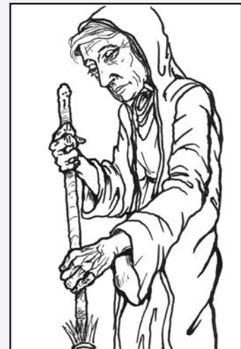
Sarai, the wife of Abram, is an old woman who has no children.

Now that we know this information, we will better understand why God wants to change the name of Abram to Abraham. Abram means “Father is praised.” Abraham means “Father of many people.” Now let us look at a promise in the agreement between God and Abraham. God says, “ ‘I will give you many descendants [future children]. New nations [countries] and kings will come from you’ ” (Genesis 17:6, ERV). This promise makes sense now that we know that the name Abraham means “Father of many people.” Maybe the name change is part of the plan of God to help Abraham have faith in the special agreement with God. God makes this agreement with Abraham when Abraham is 99 years old. His wife, Sarai, is an old woman who has no children. So, God changes the name of Abram to Abraham to help Abraham believe in the promises of God.