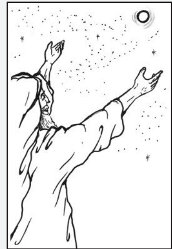
Abraham is someone who will obey the Lord.

What happens if a human breaks the agreement with God? We must understand that the agreement itself does not change. But when someone breaks the agreement, God cannot keep His promises. The special connection of love and trust between God and humans is broken, too.