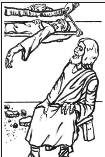
The four men lower their sick friend down to Jesus.

The man who cannot move his arms or legs has four friends. These four friends rip open the rooftop of the house where Jesus is visiting. Then the four men lower their sick friend down to Jesus. Will Jesus heal this awful sinner? Will He say the word to heal the man?