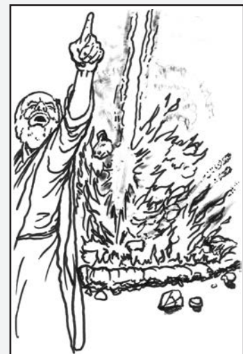
Elijah has just seen a big miracle. God sends fire from heaven.

So, Elijah starts to run. He tries to get away. Sometimes we are the same as Elijah. We run when things get bad. We may run to the refrigerator. Then we try to make ourselves happy by eating. Sometimes we try to sleep our problems away. Sometimes we look for someone new to love. Or a new job or a new place to live. Sometimes we work more than we should. Some people use medicine to try to dull the pain they feel. We do all these things to try to run away from the problems that are stealing our rest from our hearts. In the end, all these only hide the real problem. They do not solve it. Often, the things we do to run from our problems only make our problems worse.