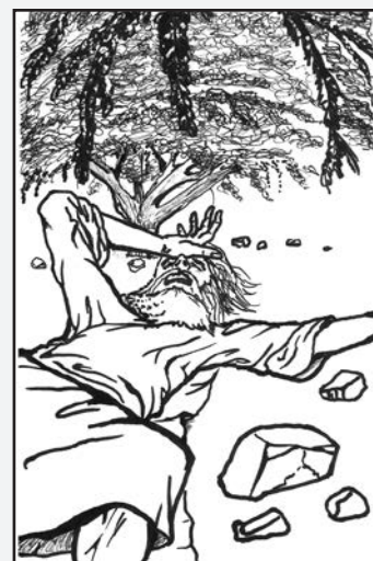
Elijah lies under a tree and wants to die. He feels his best days are over.

How does the story about Elijah teach you to rest in God even when you feel your worst? How does this story teach you not to give up hope?