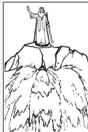
Israel drank water from the rock. Paul tells us this rock is Jesus.

Paul says that these important experiences in the desert are examples or types. These types show us baptism in Jesus. In the same way, the manna, or food from heaven, in Exodus 16:31–35 is a word picture for the “spiritual food” that Paul talks about in 1 Corinthians 10:3, ERV. Israel drank water from the rock. Paul tells us this rock is Jesus (1 Corinthians 10:4). For sure, Jesus is the “bread that gives life” (John 6:48, ERV) and the “living water” (John 4:10, ERV). Paul uses examples from Old Testament history to show us Bible truth. This Bible truth has meaning for our lives as Christians today.