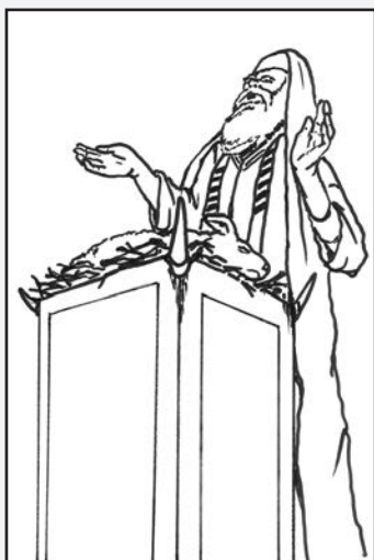
The Old Testament offerings show us the death of Jesus for us.

But we do find an important explanation in Leviticus 4:32–35 about blood. In these verses, the priest puts some blood on the altar and pours the rest at the bottom of the altar: “ ‘The priest [holy leader] will do this to make you pure [clean], and God will forgive you’ ” (Leviticus 4:35, ERV). This verse shows that blood is an important part of our forgiveness. Blood is the way that God makes us right with Himself. So, the Old Testament offerings show us the death of Jesus for us. These offerings also show us His work in heaven right now to save us.