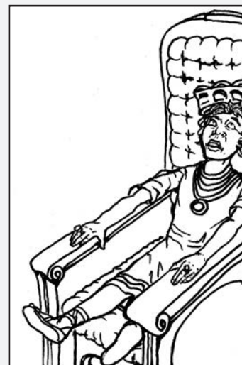
Josiah became king of Judah when he was eight years old.

We want to serve the Lord with all our hearts, right? So, what things do we need to get rid of from our homes or churches so we can do that?