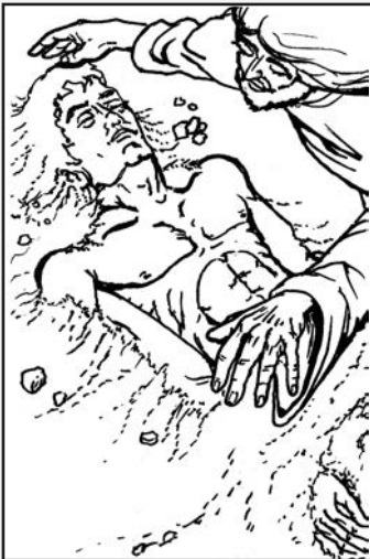
God gives life to everything.

We do not really know what “the highest [the very top part of] heavens” means exactly. But we may guess that Moses uses these words to show us that God is a beautiful and powerful King. That is why Moses says that the sky and all of heaven, too, belongs to Him. So, the “highest heavens” shows us that God has full control over everything in heaven and earth.