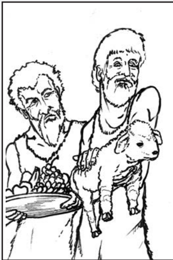
Cain grew fruit. Abel took care of sheep.

Read Micah 6:7 and Isaiah 1:11. What important rule do you see in these verses? How can we show this rule in our lives and in our worship?