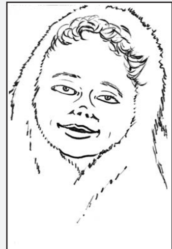
She [Eve] gave birth to a son and named him Seth.

Read Genesis 6:1–5. These verses are a powerful warning against sin. Why must we do all that we can with the help of God to get rid of the sin in our lives?