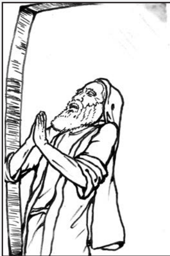
Noah worships God when he steps out of the boat.

What does Noah do first when he steps out of the boat? Why does Noah do this thing before he does anything else? For the answers, read Genesis 8:20.