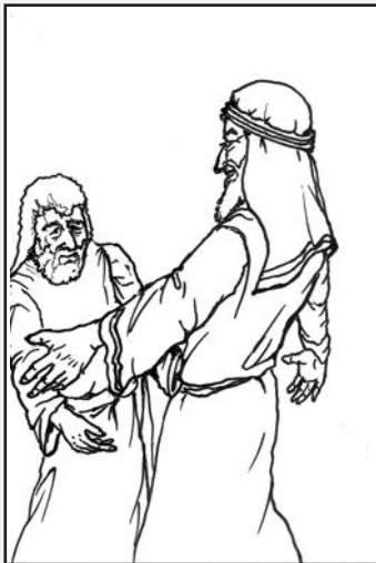
Abram saves Lot.

What do our actions teach other people about the God that we serve?