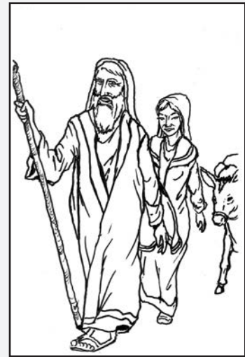
Abram leaves everything he knows: his family, his country, and part of himself.

God needs Abram to leave his past and his country so that God can show him a new land. This promise of a new land is more than a country on this earth. This promise is about the plan of God to save everyone on earth who will believe in Him: “I will build a great nation [people group] from you. I will bless you and make your name famous. People will use your name to bless other people. I will bless those who bless you, and I will curse those who curse you. I will use you to bless all the people on earth” (Genesis 12:2, 3, ERV). The Savior is the blessing that God will give to everyone on earth (Acts 3:25, 26). This blessing will come to us from the family line of Abraham. (Genesis 22:18; Genesis 26:4; Genesis 28:14).