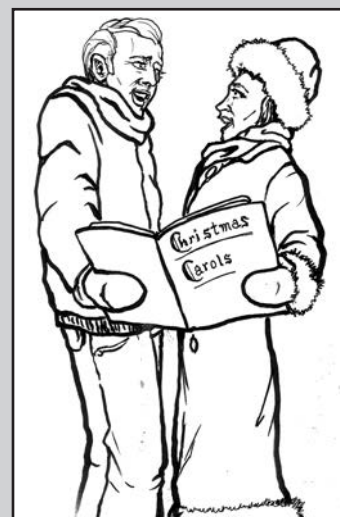
Emil looked into Ruth's eyes as they sang.