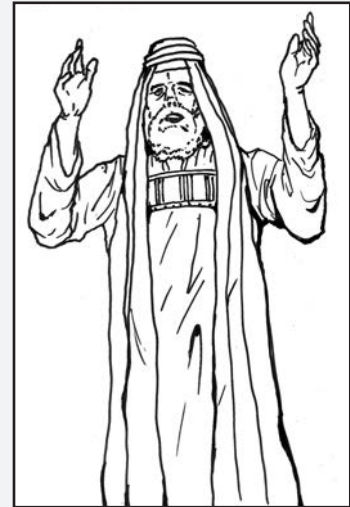
Melchizedek is a servant of God among the people at that time.

“Then Abram gave Melchizedek a tenth of everything” (Genesis 14:20, NIV). Abram gives this tithe to Melchizedek to show his thanks to God, “‘who made heaven and earth’ ” (Genesis 14:22, ERV). So, Abram shows that we give tithe to God because God owns everything (Hebrews 7:1–6; compare with Genesis 28:22). Tithe is not a gift to God. Tithe is a gift from God. Everything we own comes from Him.