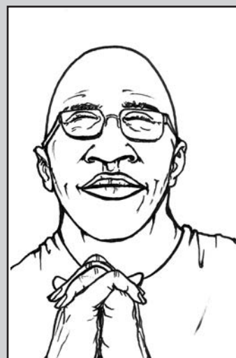
Winston kept praying.