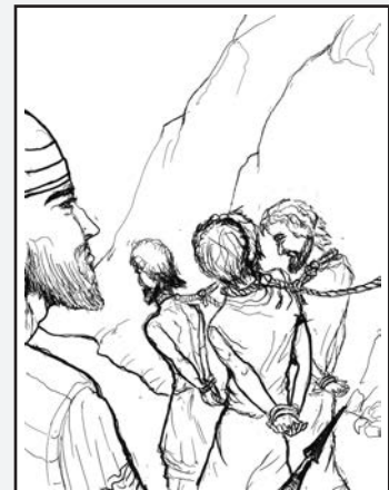
The Assyrians took the Israelites as prisoners of war and removed them from their land.

Why does Habakkuk have hope? Read Habakkuk 3:16–19 for the answer.