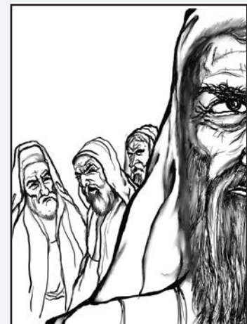
The Israelites said mean and nasty things about Moses when he was their leader.

Sooner or later, life “breaks” us or causes us to suffer. What has your experience been with being “broken” or suffering much pain? How can the Lord use your own “broken” spirit to help other people?