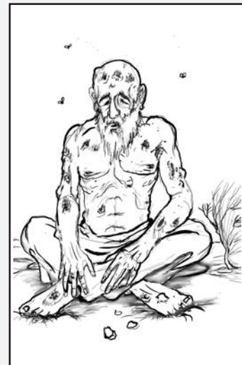
Satan gave Job painful sores all over his body.

How can we learn to trust God when life isn’t fair?