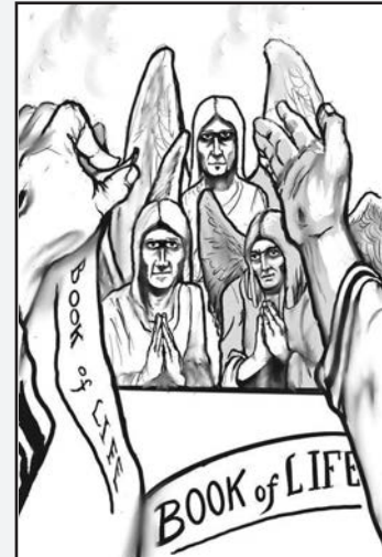
God will open the books in heaven.

The pre-Advent judgment started in 1844. As we already learned, the pre-Advent judgment is the time when God will do a careful search of His people's hearts and lives before the Second Coming (Daniel 7:9, 10). God's work as Judge during the 1,000 years will start after God takes His people to heaven. God's children will sit on thrones and will help God judge the evil dead. God will open the books in heaven. "The dead were judged by what they had done. The things they had done were written in the books" (Revelation 20:12, NIV; read also Revelation 20:4). God's people will see that God is fair in all His decisions. God rewards humans for their choices. He also explains the decisions He made.