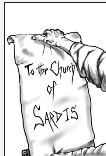
Jesus gives messages to each of the seven churches in the book of Revelation.

In Revelation 5:6, God gives John a special dream about heaven. John sees a Lamb in his dream. This Lamb looks as if it had been killed. This Lamb is a word picture for Jesus. John's dream shows us that all heaven is paying attention to Jesus and His death for us on the cross. The cross shows God's love for us more than anything else can. So, we must accept with faith everything Jesus did for us. Then God will forgive our sins (Colossians 1:14; Ephesians 1:7; Colossians 2:14). Praise God that Satan, who likes to blame us, is thrown out of heaven! We are saved because of Jesus.