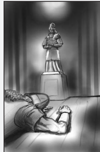
The Babylonian people believed that their gods lived in statues in temples.

Today, spiritual Babylon includes the worship of statues, just as old-time Babylon did. The Bible forbids us to bow down or worship any statue. This worship breaks the second commandment in God’s law. When we bow down to statues, we limit the Holy Spirit. Then the Holy Spirit has a hard time getting us to think about heaven. Worse, statues cause us to fail to honor God. The worship of statues causes us to reduce God’s royal beauty and might to a lifeless statue. About three hundred years after Jesus went to heaven, church leaders started to include statues as part of their worship. The leaders thought that the statues would make Christianity more popular and attractive to non-Christians. Sad to say, people often give these statues the honor and worship that belongs only to God.