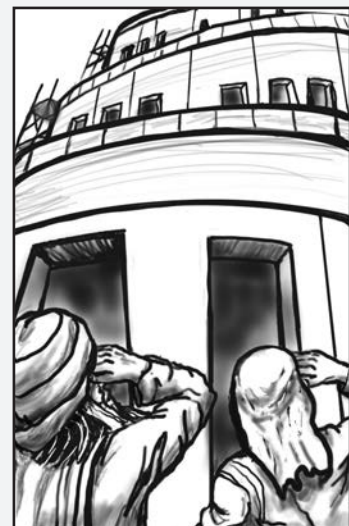
The Tower of Babel was a word picture for human pride and a wish to separate from God (Genesis 11:1–4).

So, we can see that end-time Babylon is a word picture for a worldwide religion and its false teachings. This religion fights against the Good News about Jesus and the church Jesus built. The book of Revelation shows two churches. The first church shows total trust in Jesus. This church depends on the Bible. The second church trusts in human teachers and depends on their teachings. One church depends on Jesus to save them. The other church replaces Jesus and His saving mercy with its own ideas.