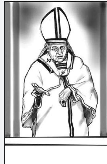
The pope is the religious leader of the Roman Catholic Church.

How does the 42-month time message help us trust that God will keep His promises?