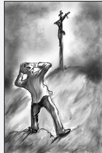
God saves us because He loves us.

Why is it so important for us to understand that we are saved by God and His mercy and not by our own good behavior?